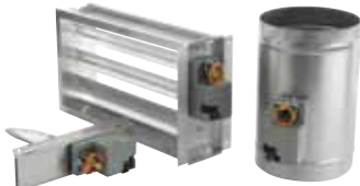
Electrically-operated dampers direct the flow of air through your ducts.