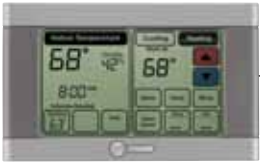
XL940 Wireless Zone Thermostat