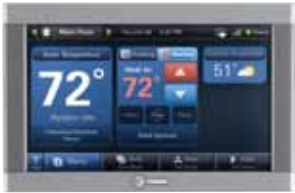
XL950 ComfortLink™ II Thermostat